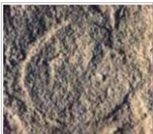
Huella de la primera Hostia