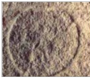
Huella de la segunda Hostia